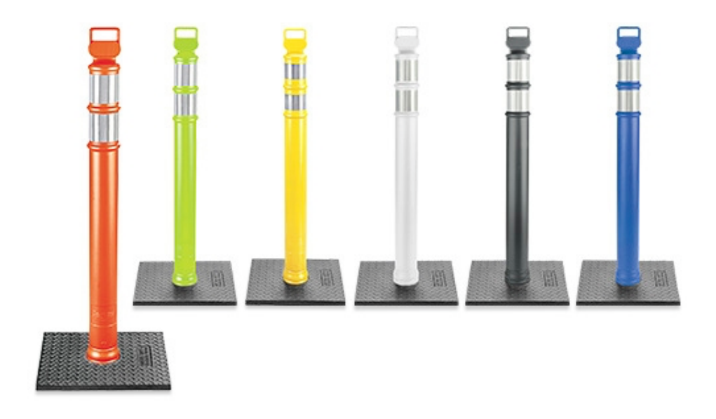
Figure 3. Representative fixed post obstacles.

Images or diagrams of obstacles used within the ASC are provided in Figure 3. These obstacles include the fixed posts and the moving obstacle. These images are representative of the kind of obstacles that ASC Teams should expect, and these can be utilized for design and development of the snowplow vehicle and its navigation, guidance, and control system for obstacle avoidance.